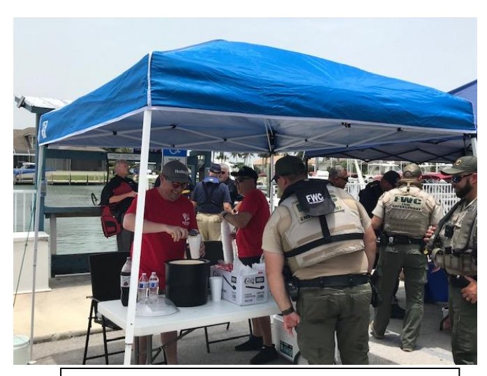
Attendees enjoying their complimentary Root Beer Floats.