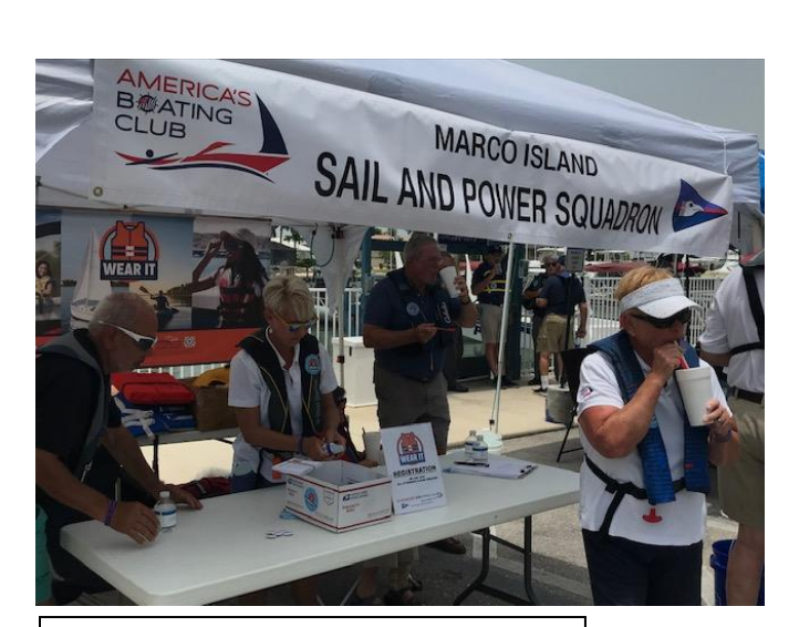
MISPS Volunteers register participants