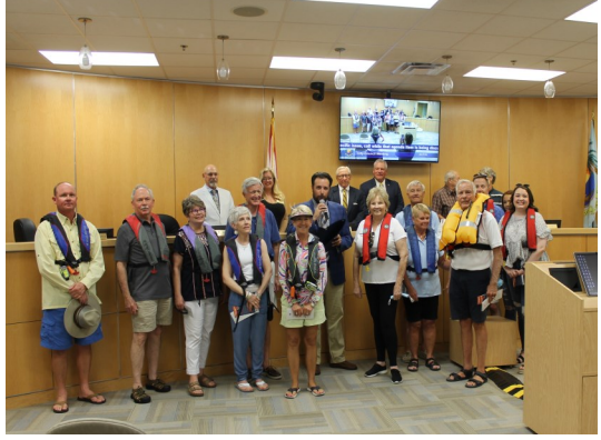
The ABC-MI Contingent in PFD's